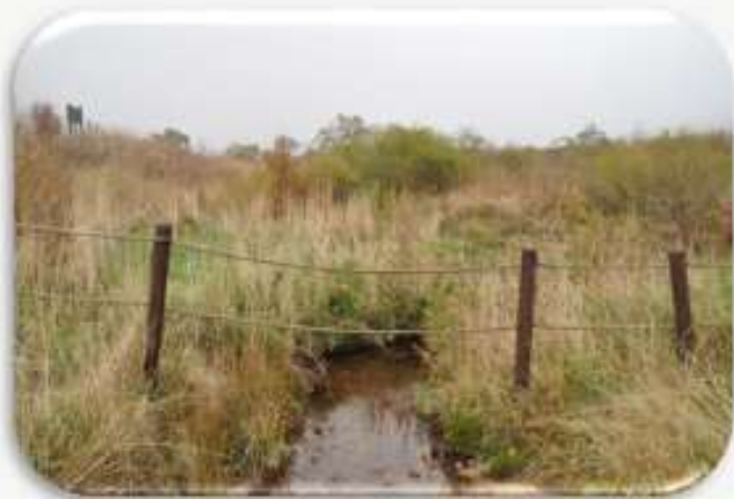
고산습지 (질미늪, 0.1%)