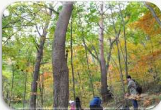
침엽수림 (소나무군락, 0.4%)