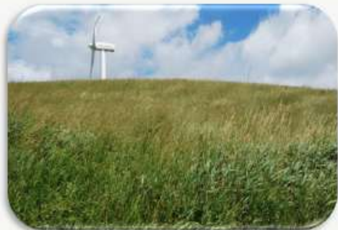
초본식생지 (목초지, 24.7%)