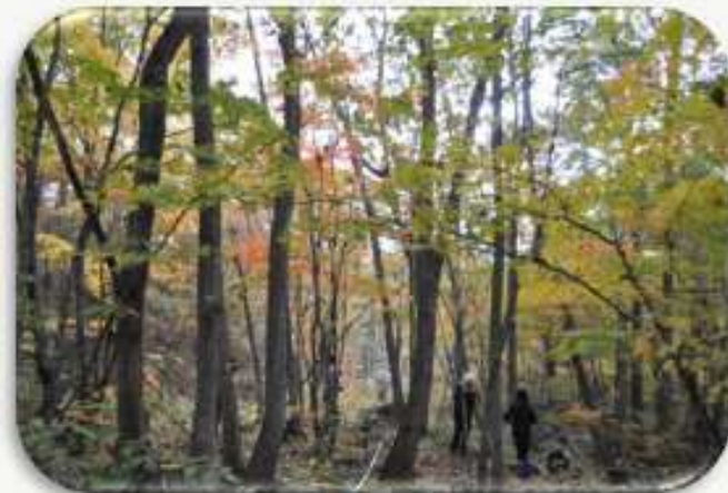
활엽수림 (신갈나무군락, 39.5%)