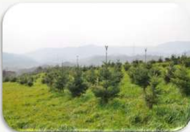
묘포장 (반지, 0.3%)