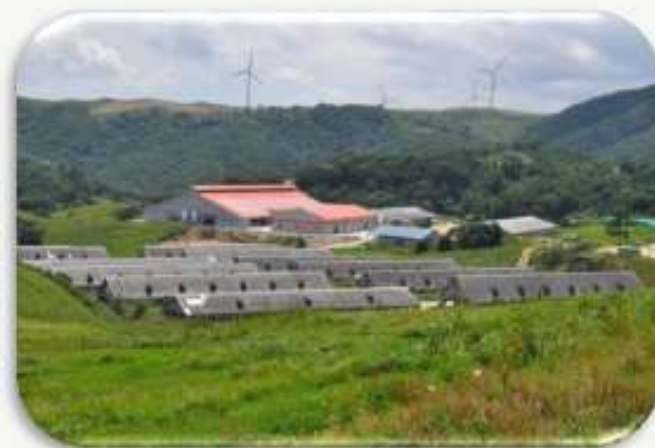
시설지 (축사 등, 0.1%)